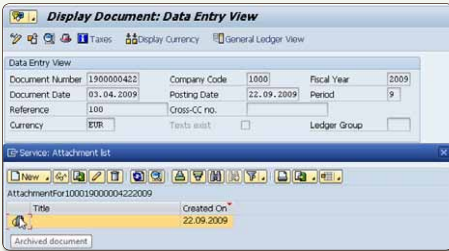
ecspand integration in SAP